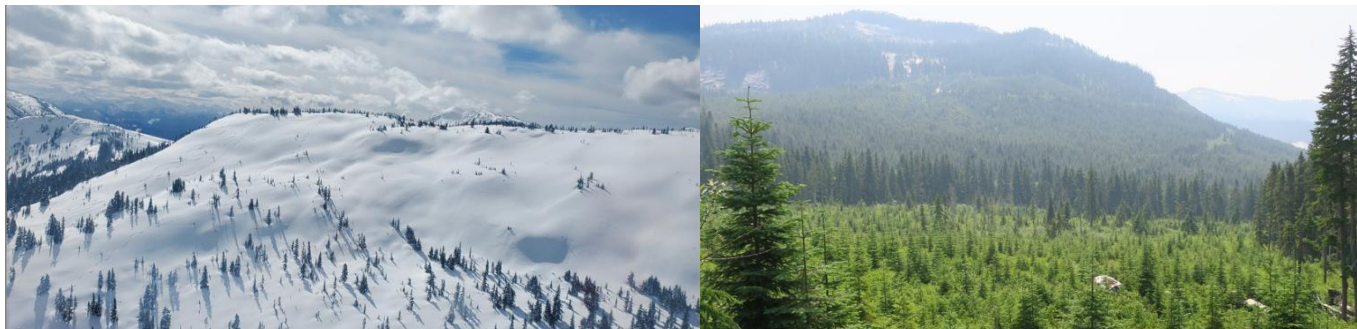
Images of the proposed project location - a resort for all seasons